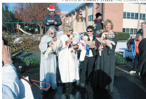
Best in Show: Malaika, Bennie, Ellie and Teddy. The four dogs belong to four friends who teamed up and dressed the dogs as the Three Wise Men and a camel.

Harley, a Boston terrier, was dressed as Santa's helper and donned a bright red and green sweater with red antlers. Harley's owners reported that they put the antlers on her a month ago "to get her used to it. They kept sliding down when we first tried it so it was good we tried them early." They